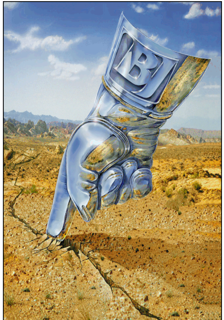
Bill White made $2.6 million serving on the board of BJ Services, a company under investigation by Congress for possibly polluting North Texas groundwater.

After Bill White’s Democratic opponent pointed out White’s conflict of interest relating to drilling in the Barnett Shale, White’s spokeswoman dismissed White’s connection to the Barnett Shale as “stock that Bill has in a retirement account.”